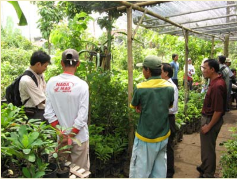
SEANAFE provides exposures to faculty members to acquire and share knowledge and experiences with farmers toward improving agroforestry