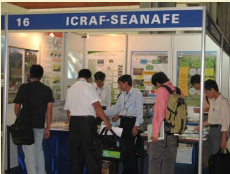
SEANAFE project experiences and lessons learned are packaged and made accessible to the public