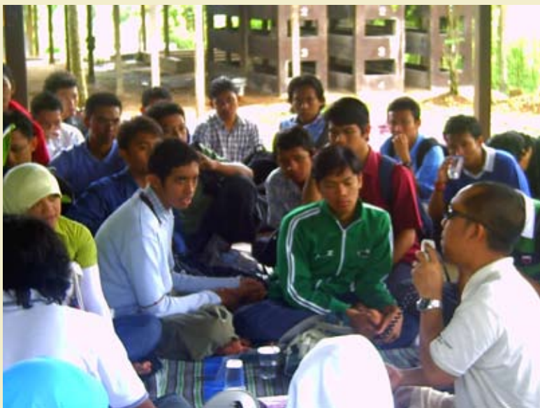
SEANAFE believes that improving the teaching-learning process in agroforestry education would help produce quality graduates capable of promoting the science and practice of agroforestry

SEANAFE is currently in its second phase of operation (2005-2009) and focusing on three major projects.