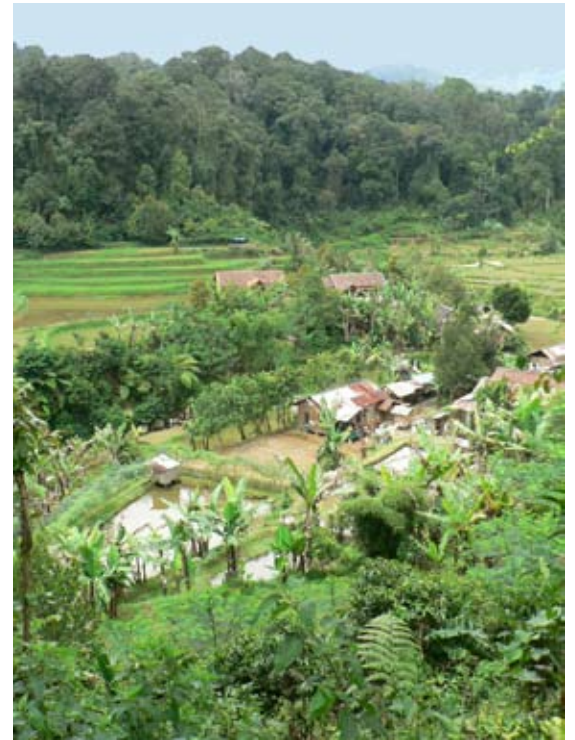
Through quality agroforestry education, SEANAFE envisions integrated and sustainable farming communities in SEA region

These projects are broadly aimed at strengthening the teaching capacities of universities and colleges in the region on subjects relating to agroforestry. The projects include major activities such as regional training, national case studies and the development of curriculum modules and training materials. Products produced under these projects are to be translated into five languages and training will disseminate outputs to at least 100 lecturers from SEANAFE member institutions.